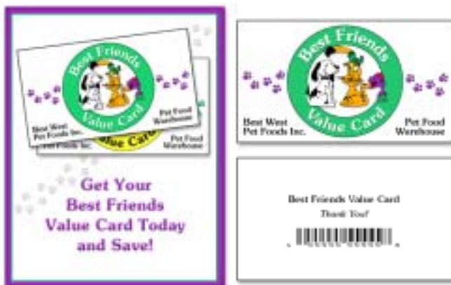
The Best Friends advertising program included customized ICD graphic customer display slides and over 20,000 customer loyalty cards.